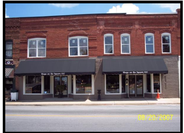
Shops on the Square