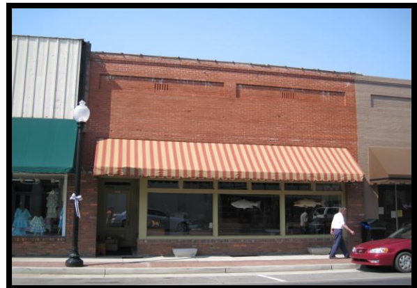
Carr Building – East Union Street