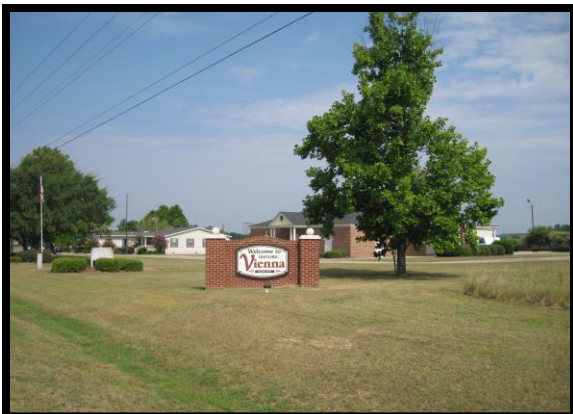
Welcome To Historic Vienna