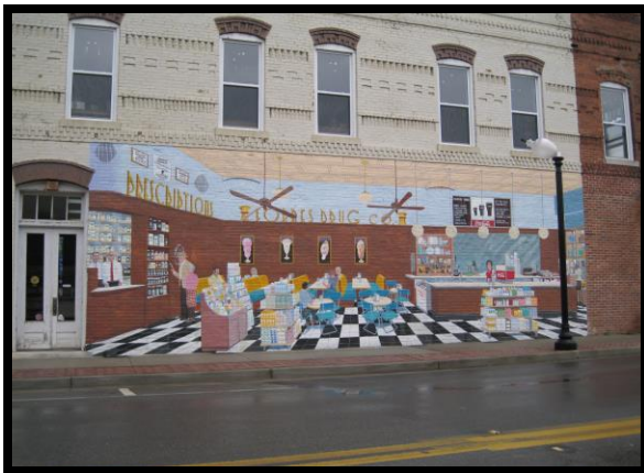
Mural Project – 1 of 3